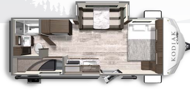
KODIAK CUB 196BH Length: 23' 8" Weight: 4,132 lbs. Sleeps: 5-6 Height: 10'5" Hitch: 440 lbs.