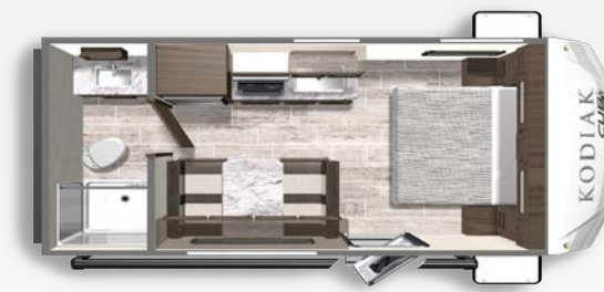
KODIAK CUB 177RB Length: 21' 5" Weight: 3,391lbs Sleeps: 3-4 Height: 10'5" Hitch: 383lbs

KODIAK CUB 175BH Length: 21'5" Weight: 3,532lbs Sleeps: 5-6 Height: 10'5" Hitch: 417lbs